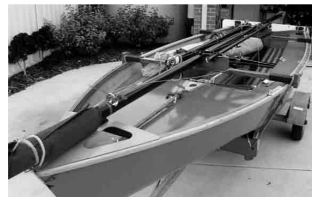
FIGURE THREE : Rolled finish using Aquacote water based polyurethane marine paint.

The advantages of modern technology have even been extended to replacement of dangerous solvent based two-pack polyurethane paints with